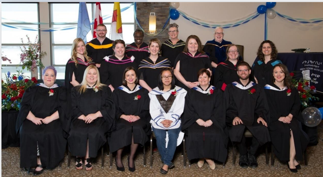
Faculty and Graduates of Nursing and Health Sciences Program, Nunavut Arctic College Convocation 2016