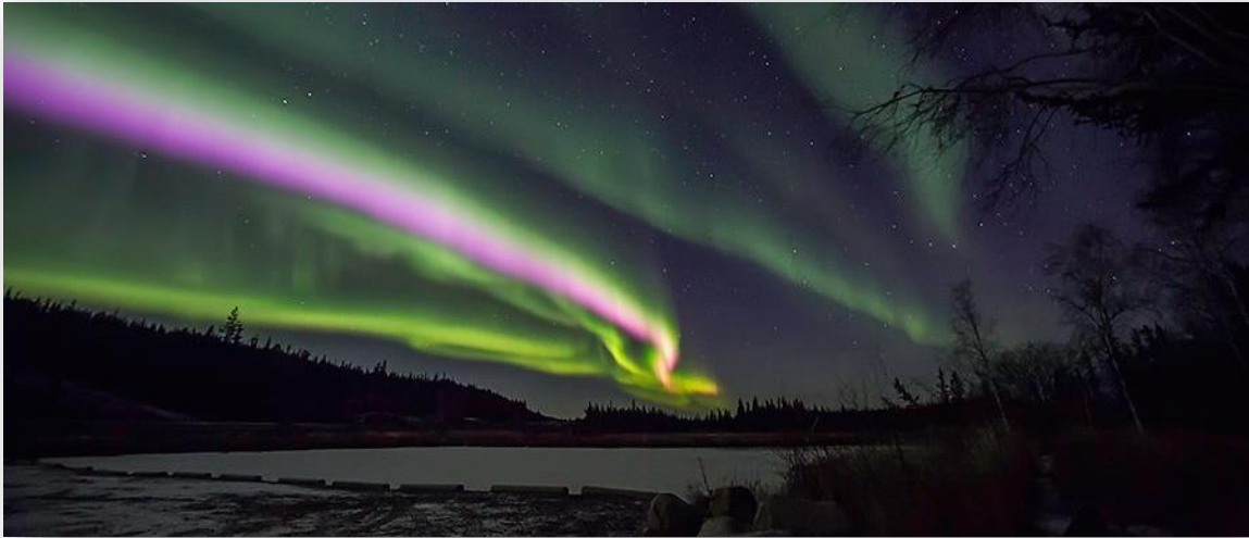
Photo taken in Yellowknife, Northwest Territories by Valerie Pond | October, 2016